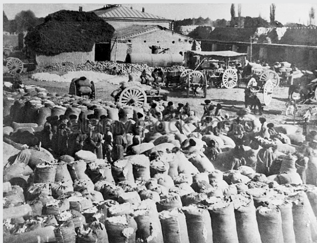
A Soviet Collective Farm, called a Kolkhoz. Using tractors and machinery, the kolkhoz was supposed to yield much more than private farms had. In reality, there were grain shortages and the government sold the proceeds abroad. Kolkhoz workers received very little payment for their work, and began to starve.