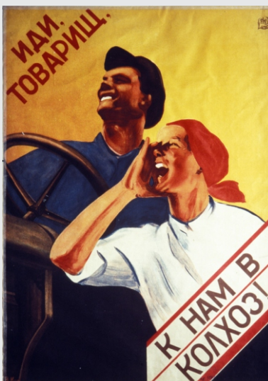
Come join us on the collective farm, comrade! (1931)

By 1934, 75% of the farms in the Soviet Union had been collectivized. Because many peasants resisted collectivization, the government used coercion and the threat of arrest to force them into compliance.