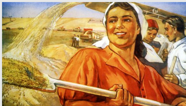
Soviet propaganda encouraged peasants to voluntarily collectivize, but the peasants didn't like giving up their private property. Government ineptitude and requisitioning caused hardship for everybody.

Collective farming was unpopular among farmers from the beginning. Mennonite farmers had been accustomed to near autonomy. Stripped of their land and resources, they began to work as common laborers, tilling and harvesting state-owned fields that once had been their own. The new kolkhoz leaders, threatened by the farmers' expertise, refused to use their practical knowledge and skill. "Poor fellows, who couldn't read or