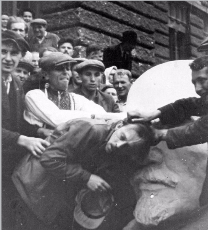
Jews were subject to brutal physical attacks in plain sight of complicit onlookers.