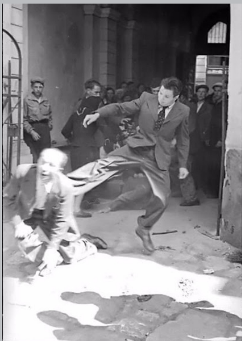
An older Jewish man kicked and sent sprawling in Lvov, Ukraine, 1941.