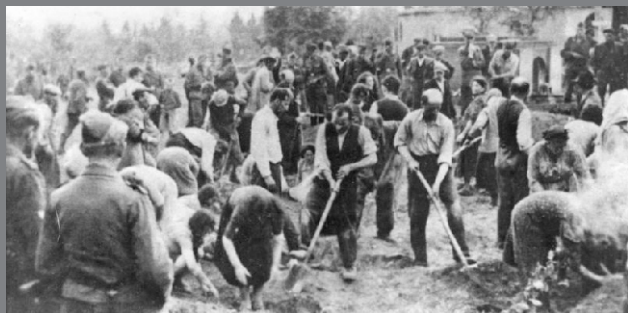
Jews digging their own graves in Storow, Ukraine, on July 4, 1941. The Germans killed thousands of communists, Gypsies, and the mentally ill or handicapped as well.

This obscene “cleansing” of enemies of the Nazi regime played out over and over. Mass shootings, concentration camps, ghettos, forced labor, starvation, and torture were part of the Eastern Holocaust.