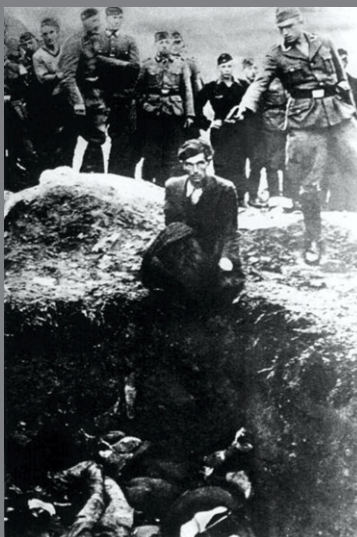
A member of Einsatzgruppe D shoots a man by a mass grave in Vinnytsia, Ukraine in 1942, while German Army soldiers look on.

During the two years of German occupation, hundreds of thousands more were killed in occupied territories. By the spring of 1943, the Einsatzgruppen had killed 1.25 million Jews and hundreds of thousands of Soviets and POWs.