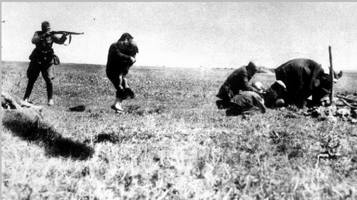
Murder of a Jewish woman and her child in Ivongorod, Ukraine, 1942.

Invading German forces wiped out Jews on the Eastern Front with horrifying efficiency. Four special units called Einsatzgruppen (task forces) A, B, C, and D accompanied the Army to carry out the "Final Solution."