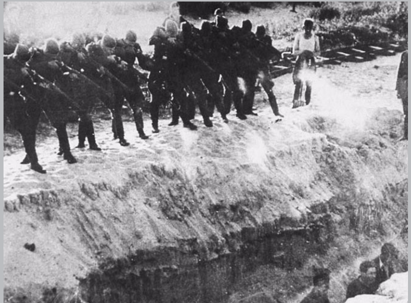
The Kovel ghetto was established on May 25, 1942, and less than three months later, "liquidated" by murdering 8,000 Jews (Aug 19, 1942). Jewish victims were driven by train from Kovel to Bakhiv where pits were dug close to the railroads. They were ordered into the pits and shot.