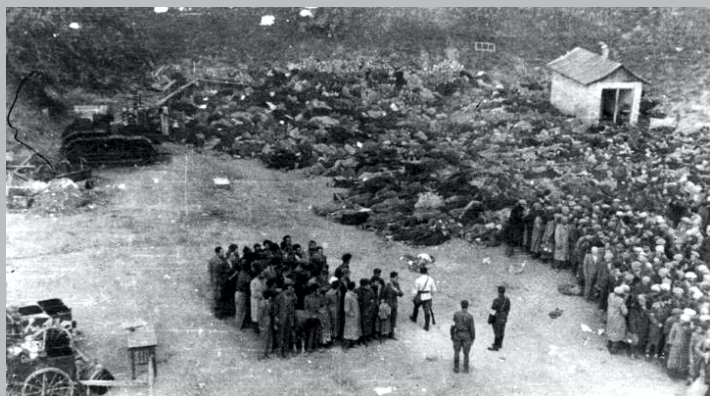
A mass execution site in Ukraine.