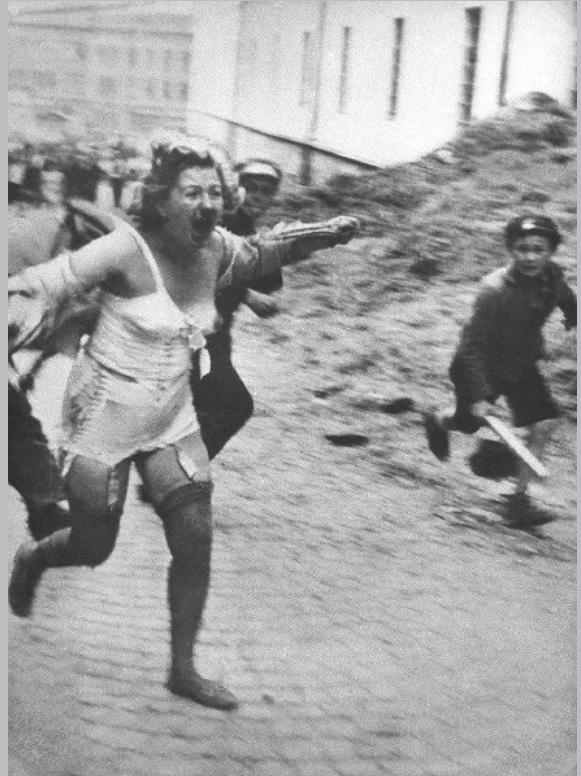
A Jewish woman runs in terror from attackers.